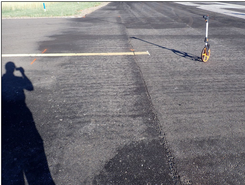
TW-01-03: L&T Cracking