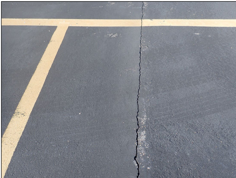
AP-02-04: L&T Cracking